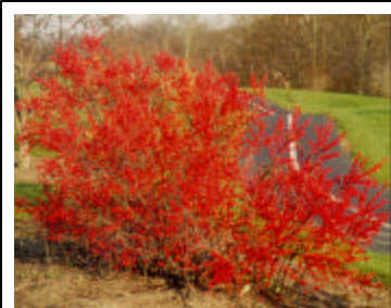
Winter Red Winterberry Holly : 2060, 2070, 2080, 2090; Bed 185–013