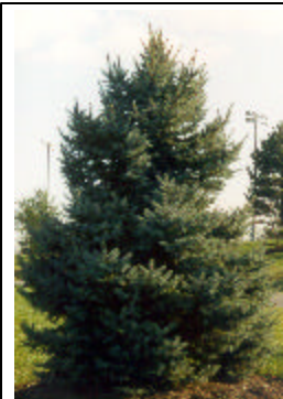
Fat Albert Colorado Blue Spruce : 2100