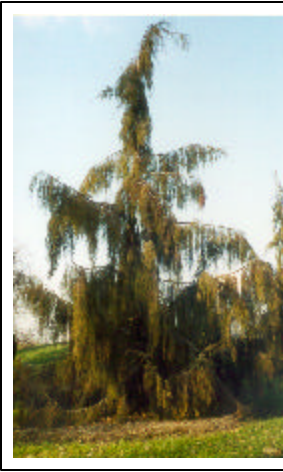
Needle Juniper: 4810, 4820, 4830, 6195, 6365; Bed 144–R16; Bed 145–R17.