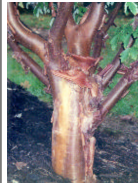
Paperbark Maple : 2860, 2870, 2880; Bed 119–H2, H3

* Numbers correspond to a tree's location on the arboretum maps available at any of the three kiosks along the arboretum walking trail.