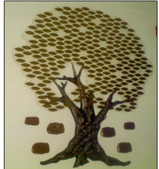
The Friends of Boone County Arboretum "Giving Tree" recognizes individuals who have made an outstanding contribution to the organization and its efforts to promote the Boone County Arboretum.