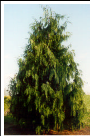
Weeping Alaska Cypress 'Pendula': 4660, 4690, 4710.