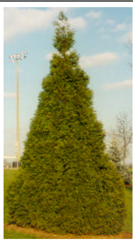
Giant Arborvitae : 5600, 5680, 5690, 5700, 5770.