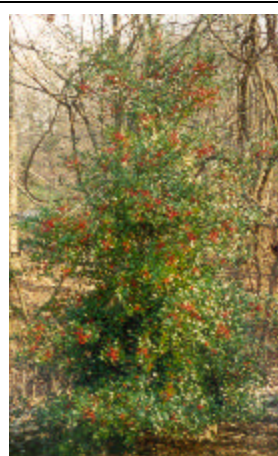
Foster Holly : 0265, 0271, 0272; Bed 3–N19